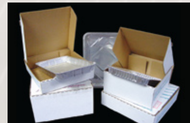
Bakery pie & cake packaging