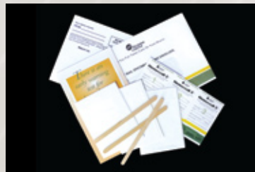
Medical test kit envelope assembly