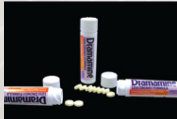
Tablet tube fill plug cap label

Many Farason employees have over 25 years technical experience, and are proficient at designing and building a variety of non-robotic automation machines. Several team members are multi-disciplinarians with backgrounds in mechanical and electrical design and build, along with programming debugging and testing. Farason leverages this wealth of knowledge and hands-on talent to create automation machines and systems that suit each customer's anomalous situation.